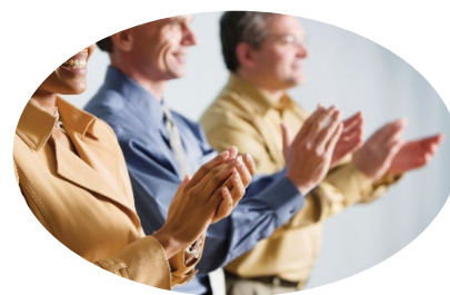
They are required to refine or restructure their finance operating model.