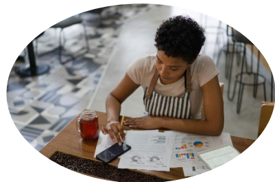
They are undergoing accounting, reporting, and regulatory changes.