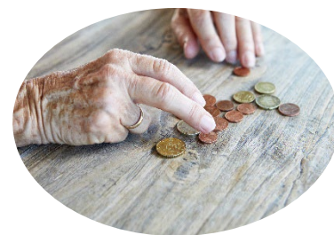
They are set to undertake a transaction or modify their financing structure.